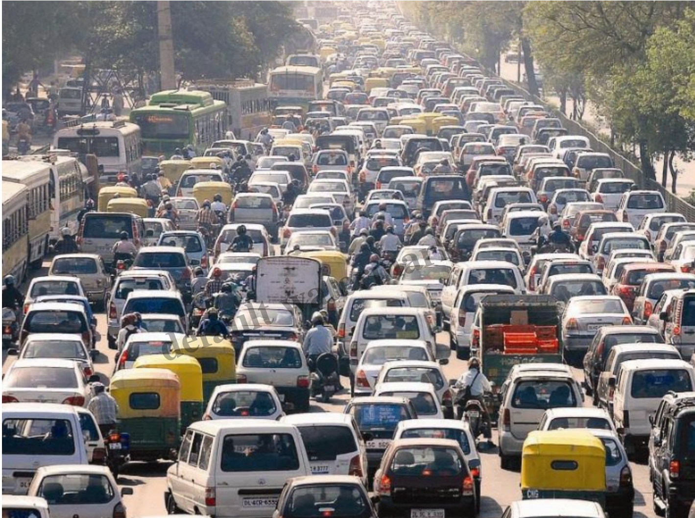
HSV Traffic (Exaggeration)

Could this mean traffic inside the Village would cause more wear and tear on our streets and roads? Might it also attract more potential new residents? Bubba thinks this could have a very positive impact on the Village as long as the Village gets the existing roads up to par with proper maintenance. He smiled at Rambo who was still trying to get comfortable in his lap and said, "What's the matter, Rambo? Do you need to go outside?" Rambo barked once and jumped down from Bubba's lap, accidentally hitting another button on the keyboard. The computer went nuts for a minute then a YouTube video started playing a song, "WHO LET THE DOGS OUT?" It was one of Rambo's favorite songs. He loved to bark along with the video.