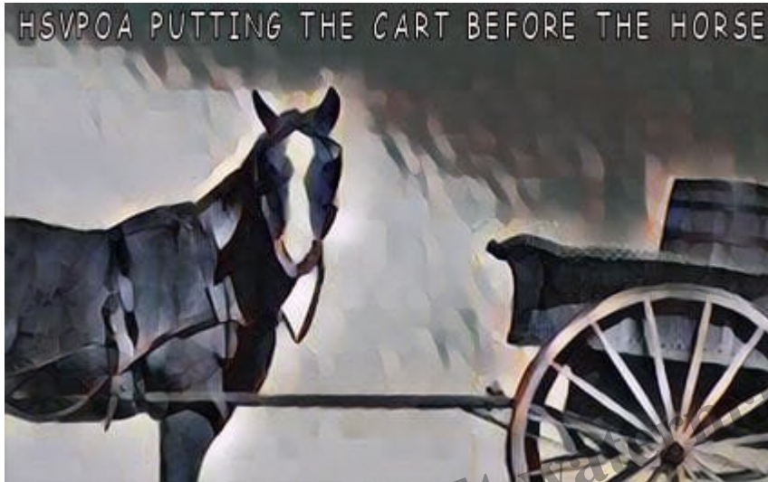
HSVPOA Cart before the horse