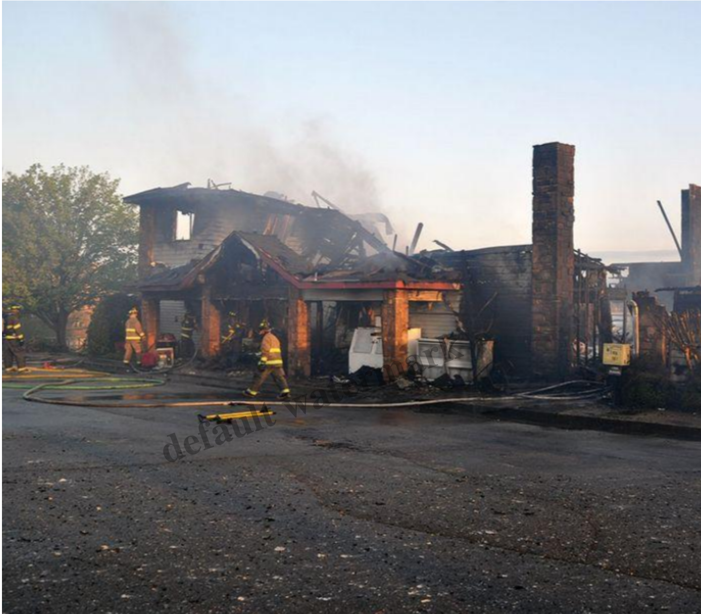
Balboa Marina Destroyed

Things that we saw, which were impressive and don't fully appreciate, not ever having actually fought a fire, were: The 5" hose hookup at the pump area and the tremendous amount of storage for hoses, ladders, axes, a chain saw, poles and gear.