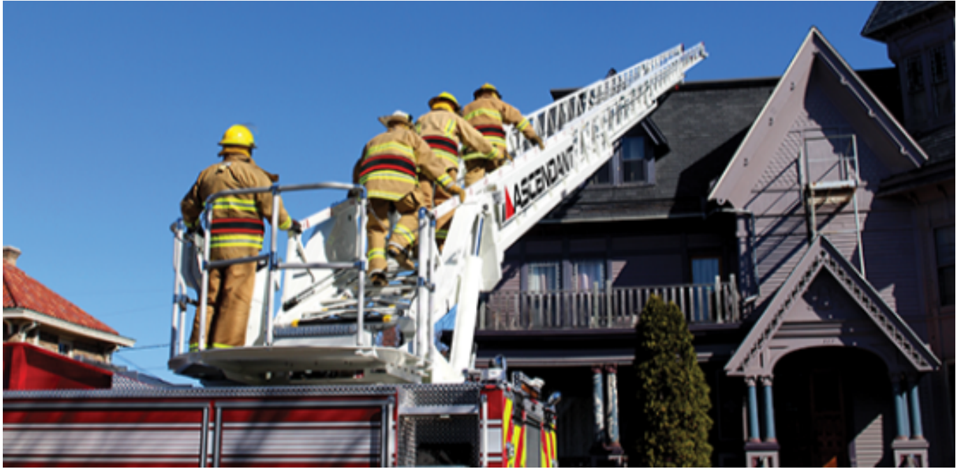
Hot Springs Village Fire Truck

“The approval and purchase of this fire truck was last February 21, 2018. The ladder fire truck is housed at Cortez Fire Station. A very good investment for the public safety of our community.”