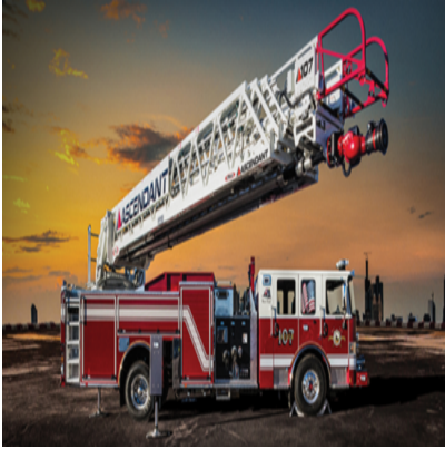
Hot Springs Village Fire Truck