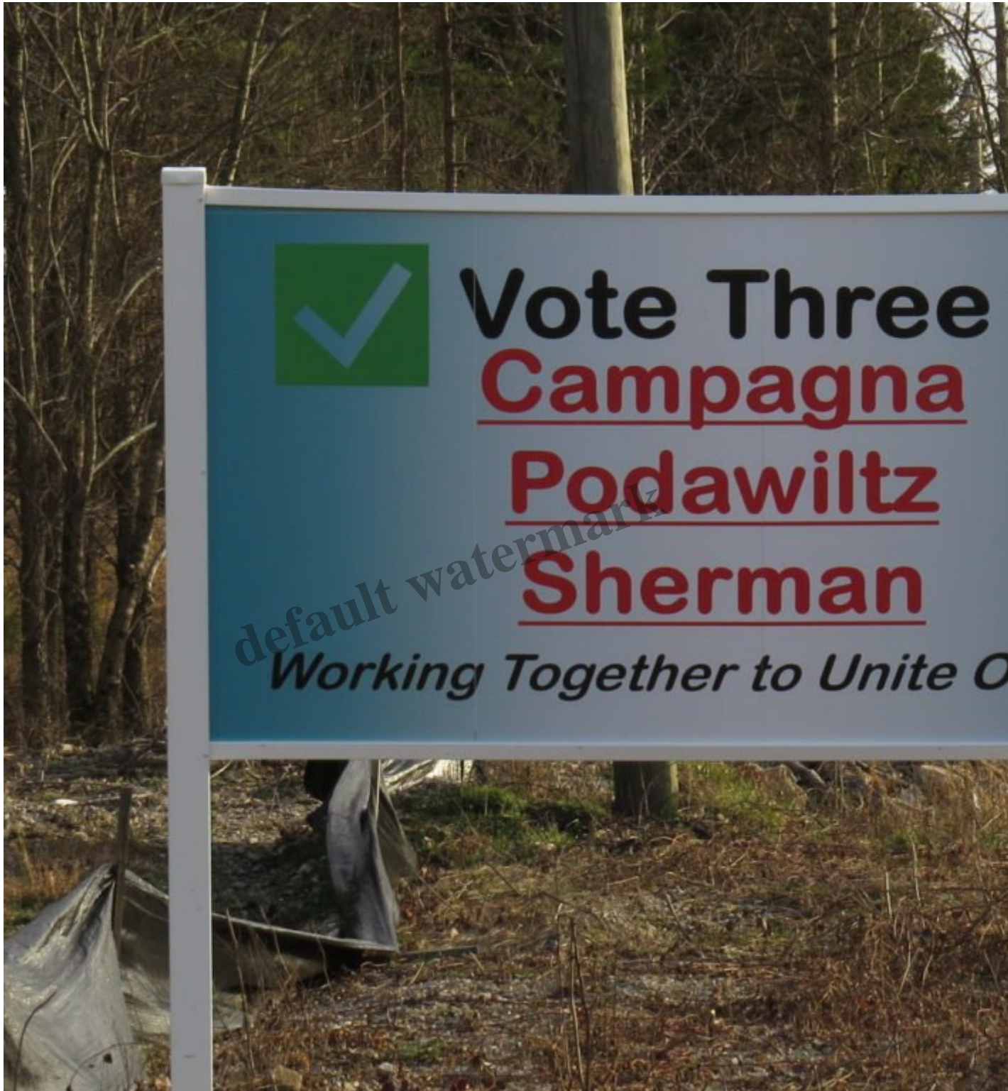
Vote Best Three for HSV Campagna, Podawiltz and Sherman