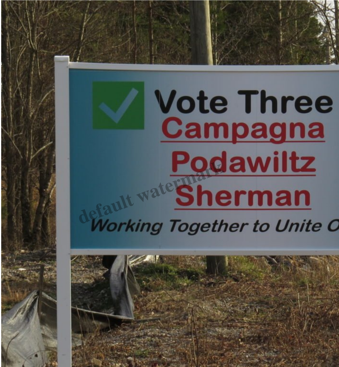
Vote Best Three for HSV Campagna, Podawiltz and Sherman